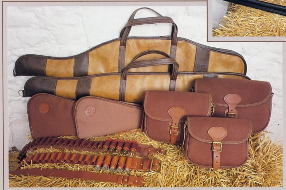
◀ Top VR45 or VR48 (45" or 48") Padded vinyl rifle cover

Second Row VC45 or VC48 (45" or 48") Padded vinyl gun cover