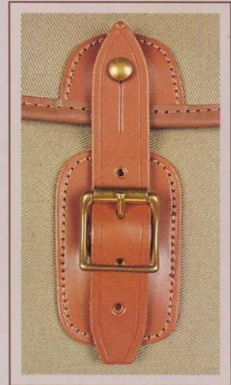
Photograph illustrates quality, strength and colour matching of our stitching.

All our guncovers and gunslips are of heavy duty construction. We use the heaviest nylon zips available (to protect gunstocks) with automatic locking sliders and several rows of stitching (to date we have never had a zip failure) zipped covers open the full length for ease of drying. All slings are of one inch wide, solid leather.