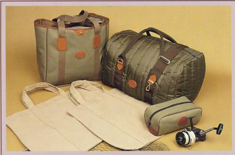
◀ Top Left TT16 Tote (16" x 16" x 7")

Top Right Fish Cool Bag FC14 (14" x 11" x 10") FC20 (20" x 13" x 12") FC30 (30" x 13" x 12")